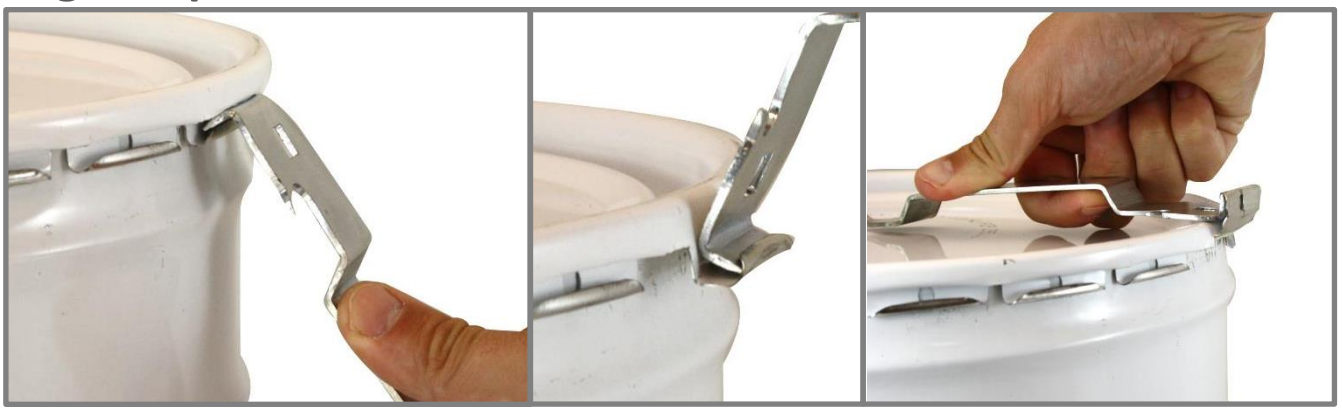
Place the head in the lug