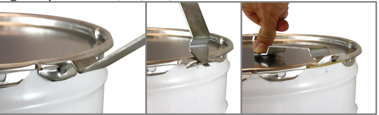
Place the tail in the hole of the lug